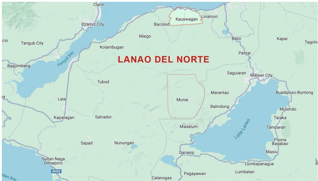
Figure 1. The Geographical Map of Lanao del Norte, Highlighting the Research Locale

Kauswagan, a 5th-class coastal municipality in Lanao del Norte, spans 60.37 square kilometers with a population of 24,193, according to the 2020 Census (PhilAtlas, n.d.). It has 13 barangays, six of which are home to Maranaos. Its economy is supported by agriculture, fishing, trade, and services, with fertile lands producing rice, corn, coconut, and vegetables, while its coastal areas are home to thriving fishing communities (Diklap, 2023)