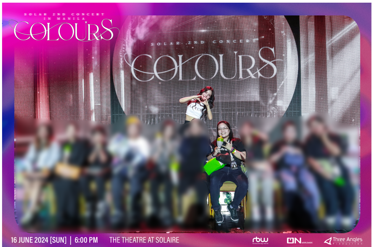
A group photo opportunity with Solar, the leader of MAMAMOO.

even informal live videos such as BStage, Instagram, and YouTube. Without them, this research would never have been possible, and without them giving me the strength, I would have never finished this research. A wishful dream of mine is for them to be able to read this research to see the impact they have made on people like me and the respondents. Thank you for everything, MAMAMOO, saranghanuuu, and I will never let go!